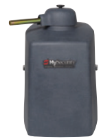
Swing Gate Operator

HySecurity operators secure the world's critical infrastructure and key assets where ultimate reliability is vital. SwingSmart DC delivers that same uncompromising quality to commercial customers, where ease of use, consistent operation, low maintenance, long life and high reliability is expected.