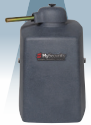
Swing Gate Operator